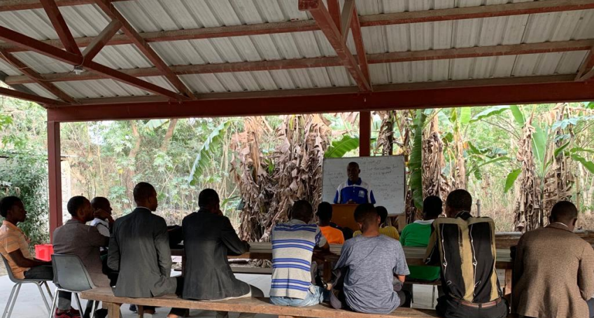
God's work in Haiti