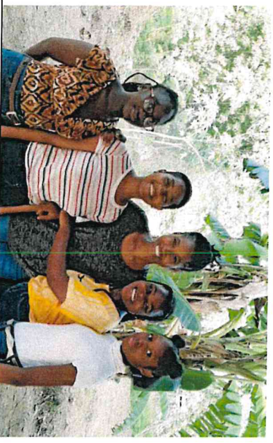
Sisters at Sonlight Sisters in Christ Sisters Forever