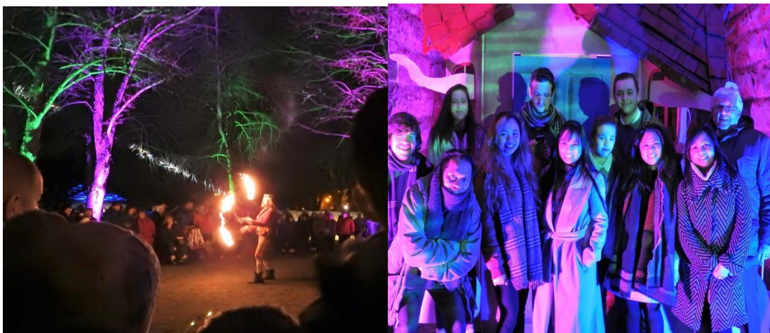
An outing to a light show on the banks of the river Tay in Perth