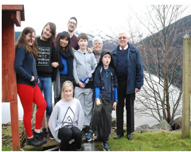
The Perth contingent

Over the weekend 29^{th} - 31^{st} January we supplied some of the back-up work for the Cumbernauld church youth retreat. This was held at a youth hostel lodge on the banks of Loch (Lake) Lomond. Despite the stark winter climate the scenery was still a vivid reminder of God's beautiful creation. The rough man made roads leading to the Lodge provided some painful contrast. Five of the Perth church youth club went to the retreat – their first experience of the lessons and activities that were held. Their verdict, "Can we go next time too?"