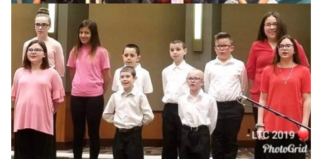
LTC 2019 PhotoGrid